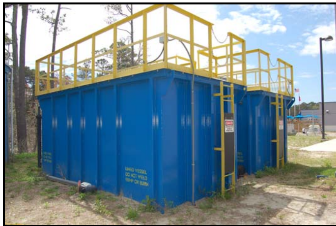
Tanks and Membrane Housing